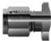
A -Two ferrule A-LOK® compression port