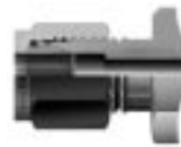
Z -Single ferrule CPI™ compression port