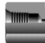
F -ANSI/ASME B1.20.1 Internal pipe threads