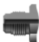
V -VacuSeal face seal port